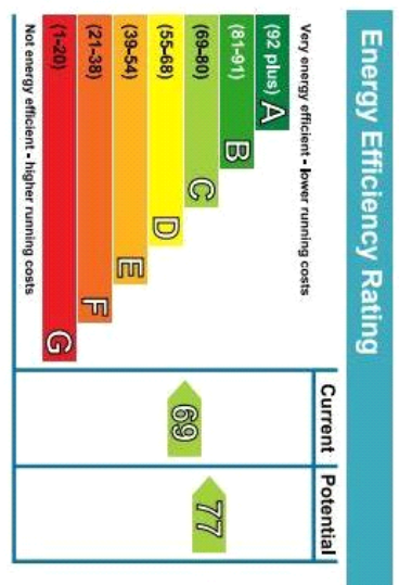
For Full EPC information, click here